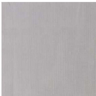
Z 002 NATURALE