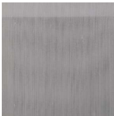
Z 003 BIANCO

PER I COLORI SPECIALI QUANTITATIVO MINIMO Mt. 1000 FOR SPECIAL COLOURS MINIMUM QUANTITY Mts. 1000